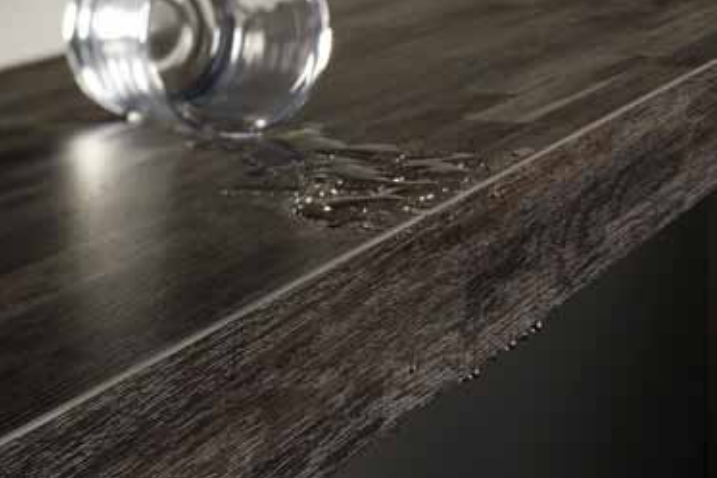
Döllken AQUA-STOP-PEN ensures a watertight seal.