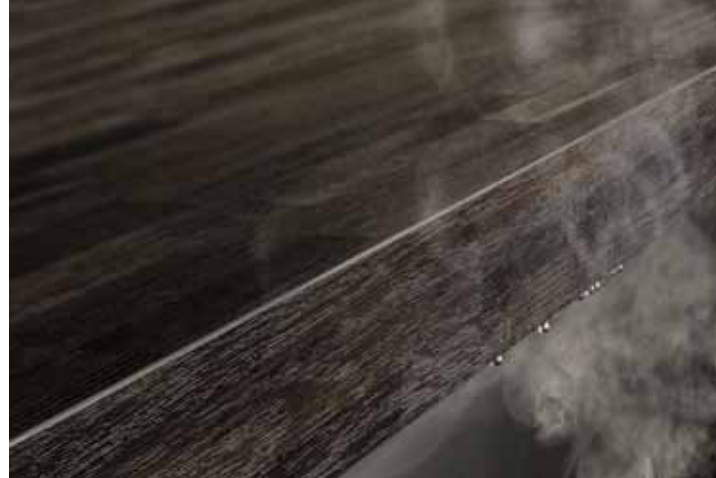
Steam too is no longer a problem.

Water and moisture such as in the kitchen and bathroom can no longer damage your wood-composite board thanks to Döllken AQUA-STOP-PEN which seals joints quickly and, above all, reliably. Just apply a thin layer, leave to dry for one minute and the joint is watertight.