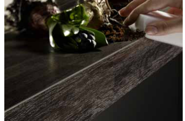
The sealed edge can be cleaned quickly and easily.

Fine water vapour can cause adhesive joints to swell – board joints in particular provide the largest area for water to penetrate. But not anymore because Döllken AQUA-STOP-PEN also provides enhanced protection against moisture penetration.